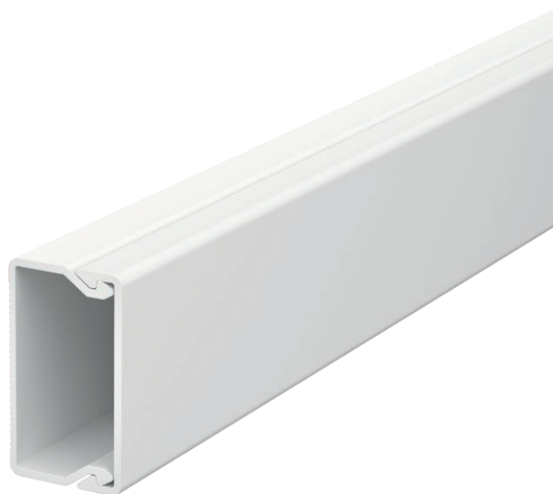
Trunking cover and base with base perforation.